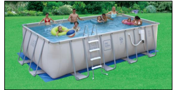
3. FILL WITH WATER