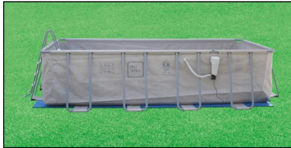
2. ASSEMBLE HORIZONTAL & VERTICAL BEAMS