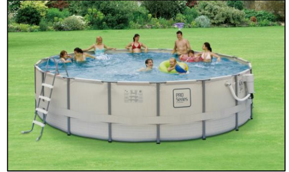
3. FILL WITH WATER