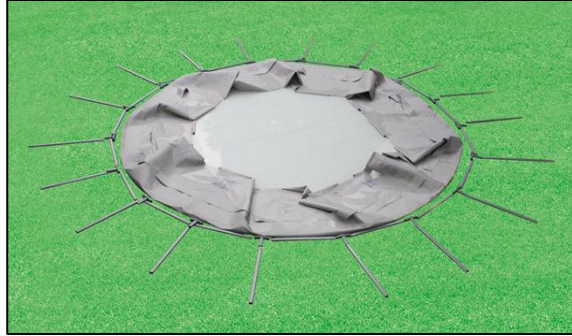
2. ASSEMBLE HORIZONTAL & VERTICAL BEAMS