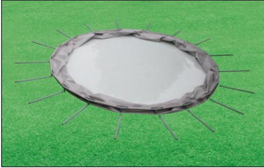
1. SELECT LEVEL LOCATION